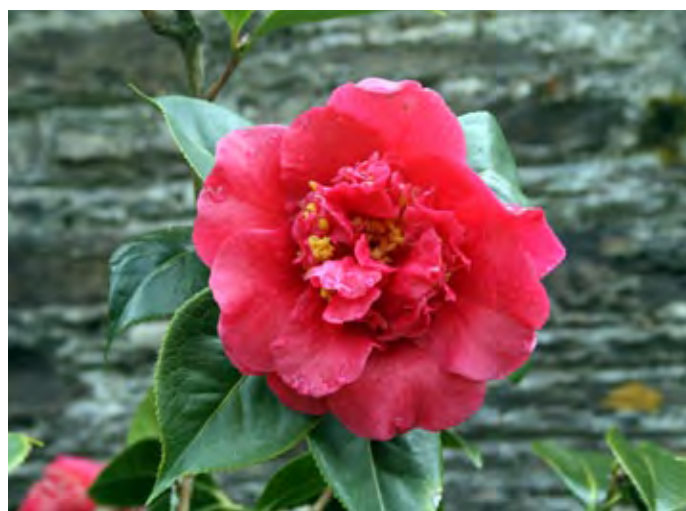
Camellia 'Forty-Niner', a glowing red C. reticulata hybrid.

The garden is protected by Ethy Wood which still belongs to The National Trust and further out by a Pine Wood which belongs to the Forestry Commission.