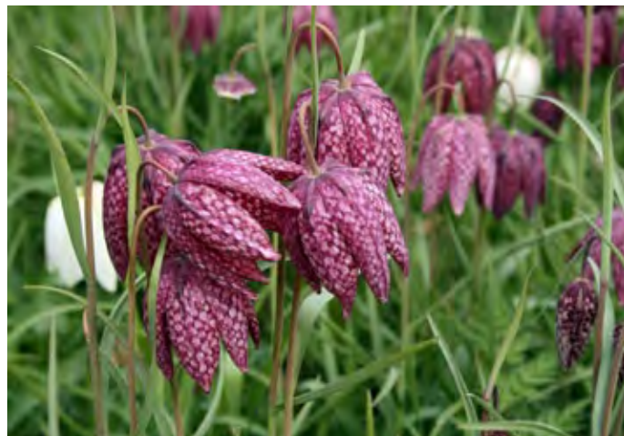
Fritillarias in the lawns on the north side.

Sadly the sunshine that had lit up our previous visit had gone, and it was decidedly chilly near the water. Where we entered the grounds there is a magnificent Turkey oak, planted in 1750, but which collapsed in 1900 and has since sprawled on props over a large area in front of the house.