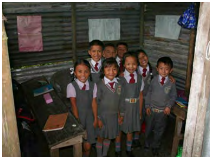
The corrugated iron school in Sikkim and it's pupils.

He writes:- "Basically I am building a garden which will contain lots of rhododendrons and other plants that are found in the state of Sikkim: there will be a school classroom made from tin roofing sheets, a small water-feature, prayer stones, etc, as much as its about showing the public about species rhododendrons its mostly about raising money for the school".