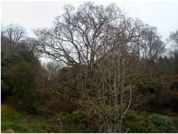
The Lukesland's 'Champion Tree'