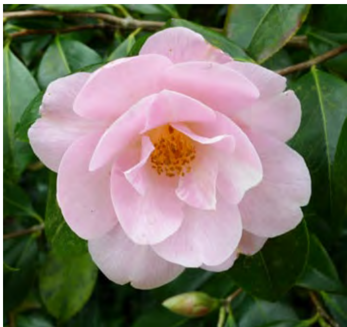
Camellia 'Bowen Bryant'

It had been owned by the Bryant family for the previous ninety three years. The Camellia 'Bowen Bryant' has now been planted by the house in their memory.